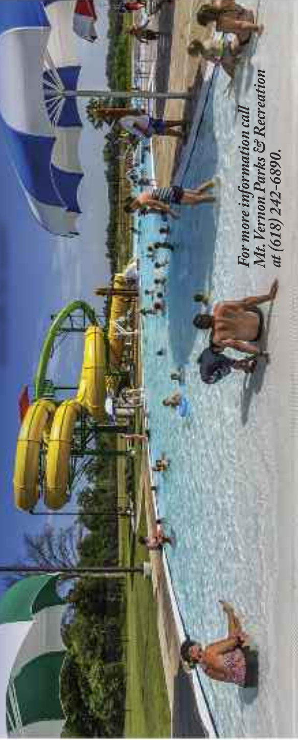
For more information call Mt. Vernon Parks & Recreation at (618) 242-6890.